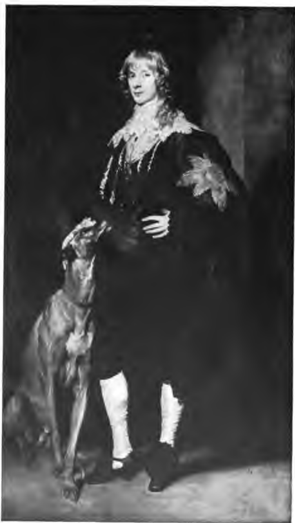
JAMES STUART, DUKE OF LENNOX BY ANTHONY VAN DYCK